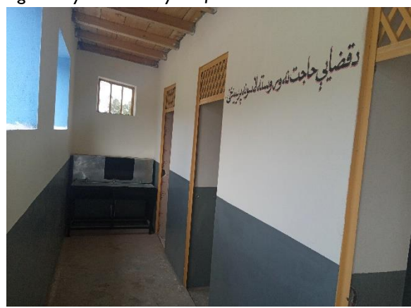
Figure 2: toilets with hygiene message on the wall

Use of soap and purpose of hand hygiene: Since soaps were made available teachers stated using soap for keeping hands cleaning however, they were available only at a common location. Messages on hygiene have been written innovatively on the walls near the entrance of the toilets and other WASH facilities. There are 9 hand washing facilities (water points), out of these three only has soap availability (1/3 rd ). All the student respondents stated purpose of hand hygiene being to reducing germs and avoid diseases. The common diseases associated with poor hygiene were diarrhea, cholera and dysentery. Students could not associate infections and malnutrition being associated with each other. There were only limited IEC posters displayed in the schools.