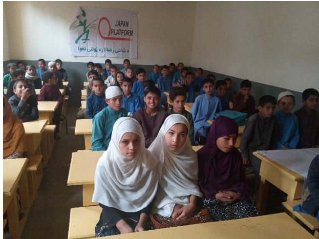
Figure 1: classroom in Kuz Sagy school constructed by SVA

The students per classroom ratio after operationalisation for Kuz Sagy and Salarbagh in two shifts was 28.2 and 20.4 respectively which has substantially reduced from before the project which was 59.5 and 33.5 for the two schools respectively. The class size recommendation is students 15-21 students 8,9 , which hints possible higher overcrowding in Kuz Sagy as compared to Salarbagh classrooms effecting the teaching. Considering the high ratio of students with newly built classrooms, Directorate of Education expressed concern with insufficient number and that chances of classes being conducted in open field could not be ruled out. However, community members felt the size of the newly built classes was right.