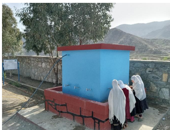
Figure 3: water with 9 outlets in school premises

Two water reservoirs and 18 water points were established in both schools. Water quality was tested by DACAR organization and the results of quality test were satisfactory for drinking. All the planned toilets' constructions, water pipeline and water connection are completed and are functional within both the school premises. Table 8 presents the summary of WASH construction undertaken by project.